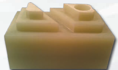
GFK EGS 619: 80% glass & 20% epoxy