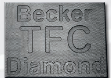
CFK Carbon fiber